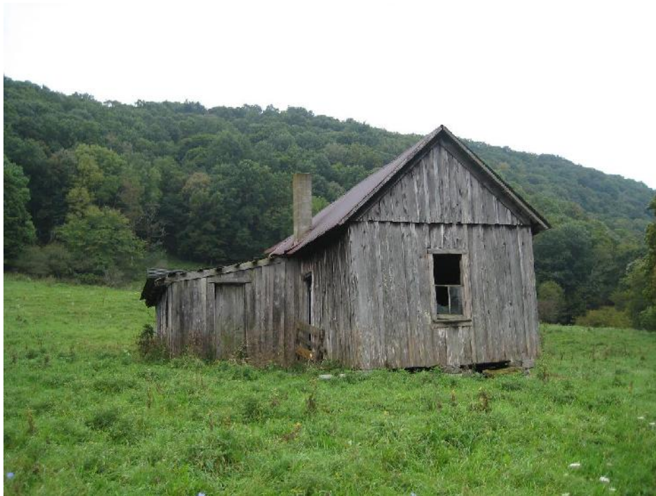
The Cabin as it looks in the summer season