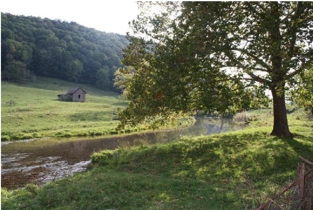
As the water flows in the creek, the cabin waits in the distance