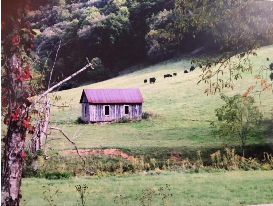
The cattle grazing above Cripple Creek