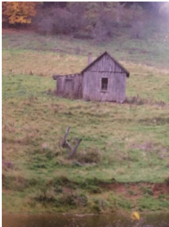
Cabin on the slope