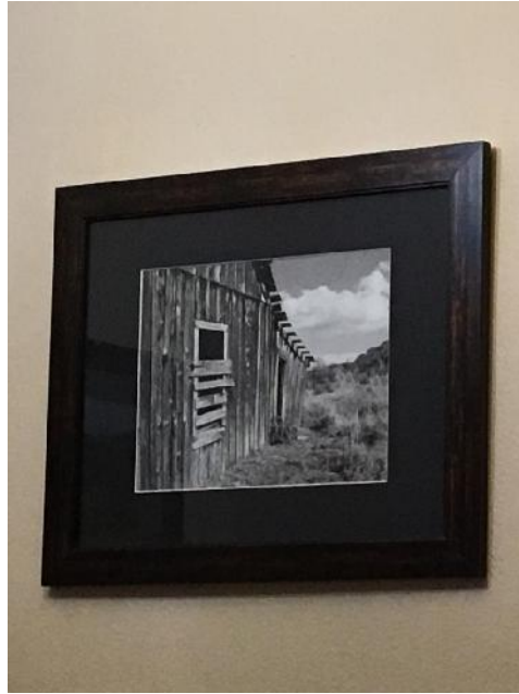
Seen here, the cabin has wood along the side and slats nailed over one window.